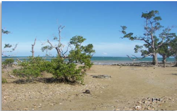
View of beach from shore