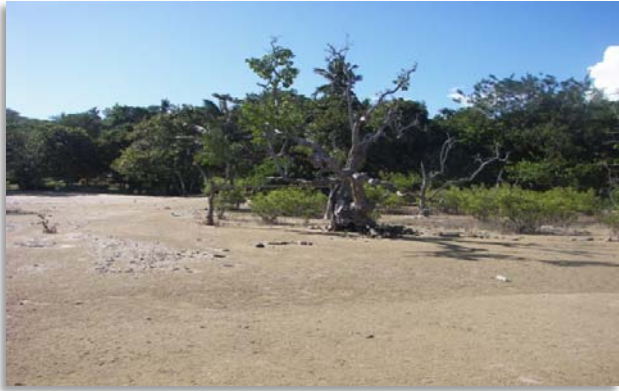
View of property beach