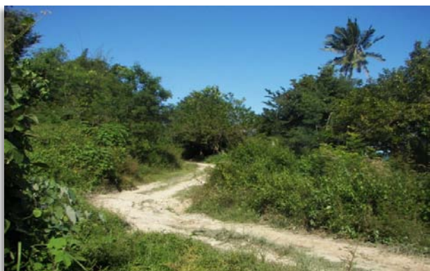
View of road access