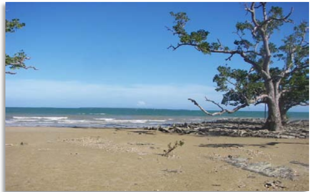
View of beach from shore