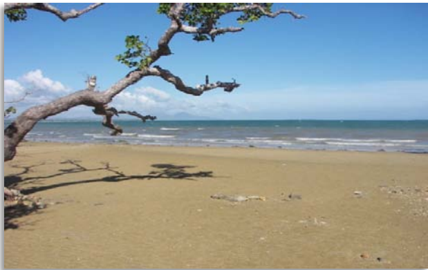
View of ocean from beach