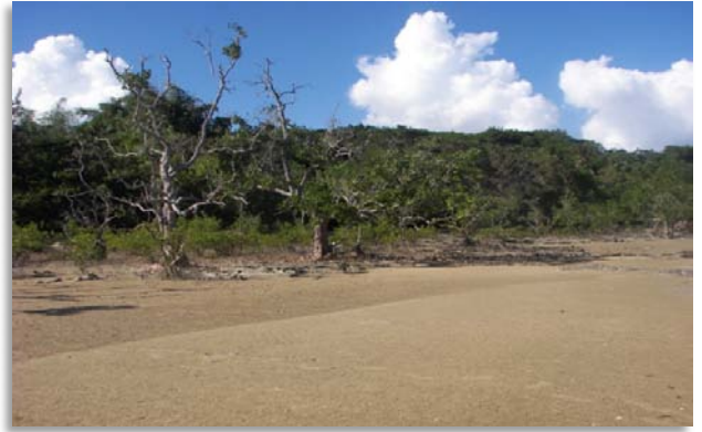
View of property beach