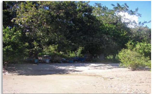
View of interior from beach